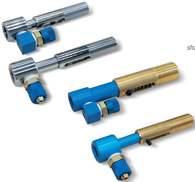
VERSION 20 80 . .